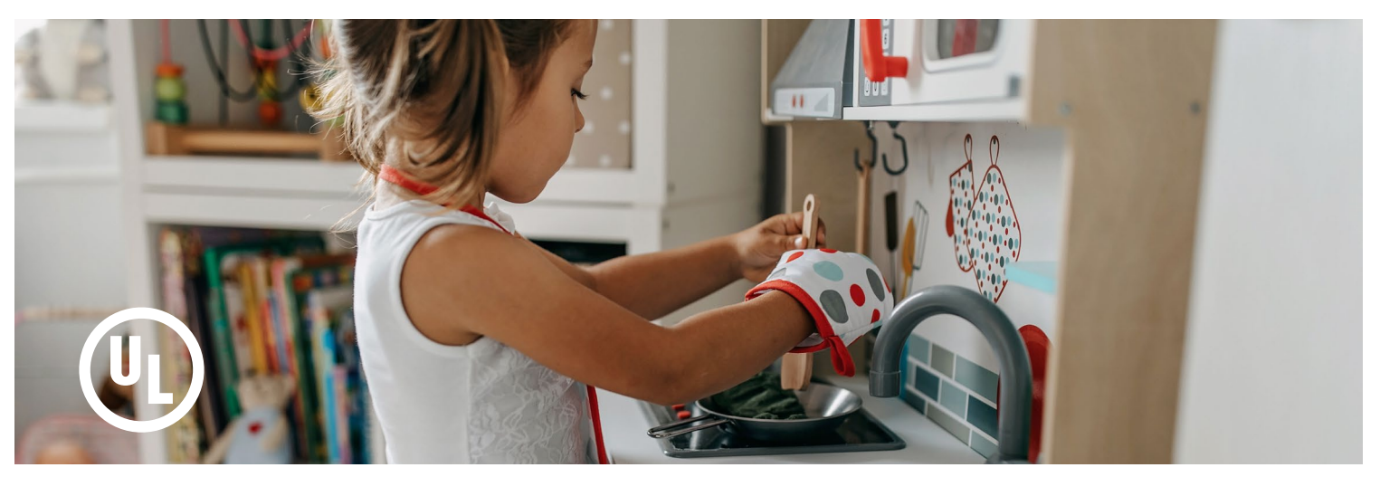
*Note: This is an evolving topic, so effective dates may continue to change.